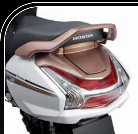
DOUBLE LID EXTERNAL FUEL FILL