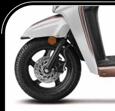
TELESCOPIC FRONT SUSPENSION